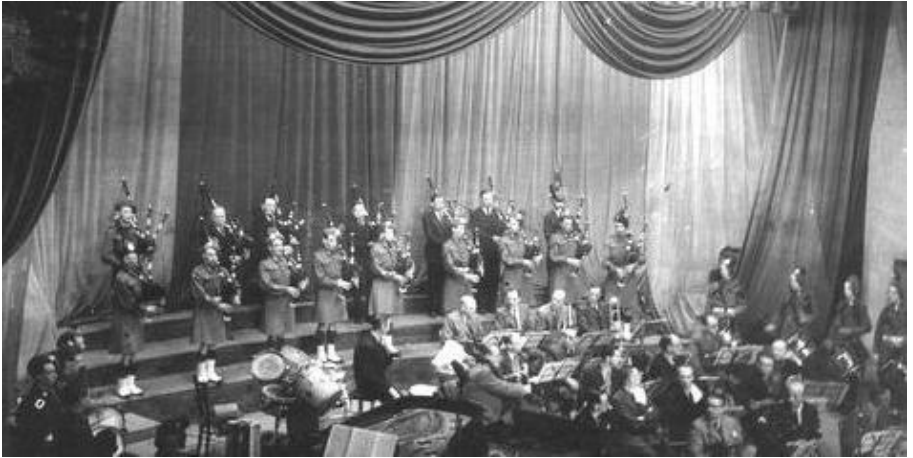
The Pipes & Drums of the London Rifles at the BBC (circa 1940) The Young Soldiers' Bn, the Cadet Company and some old stagers from the Great War rehearse for a BBC programme. Unusually for the London Irish the pipers are wearing blanchoed spats.