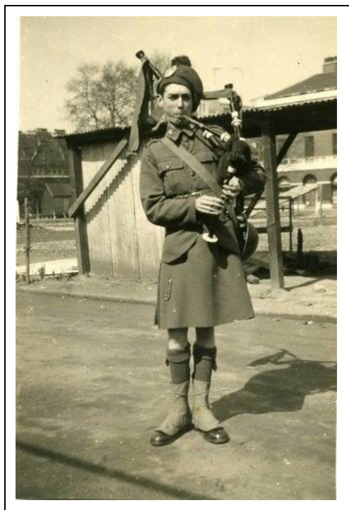
My first attempt at the 'pipes aged 16.

I went home walking on air and told my parents. My Mother, like all mothers, wasn't too keen on the idea. My Father, who had been in the Royal Engineers in Mesopotamia (Iraq), thought it would do me good. So I went and joined the Cadet Company of the London Irish Rifles and promptly started to learn the pipes.